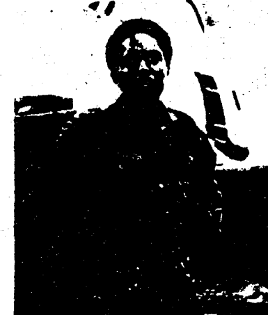
Black journalist Wallace Terry covered the Vietnam War for TIME from 1967 to 1969.