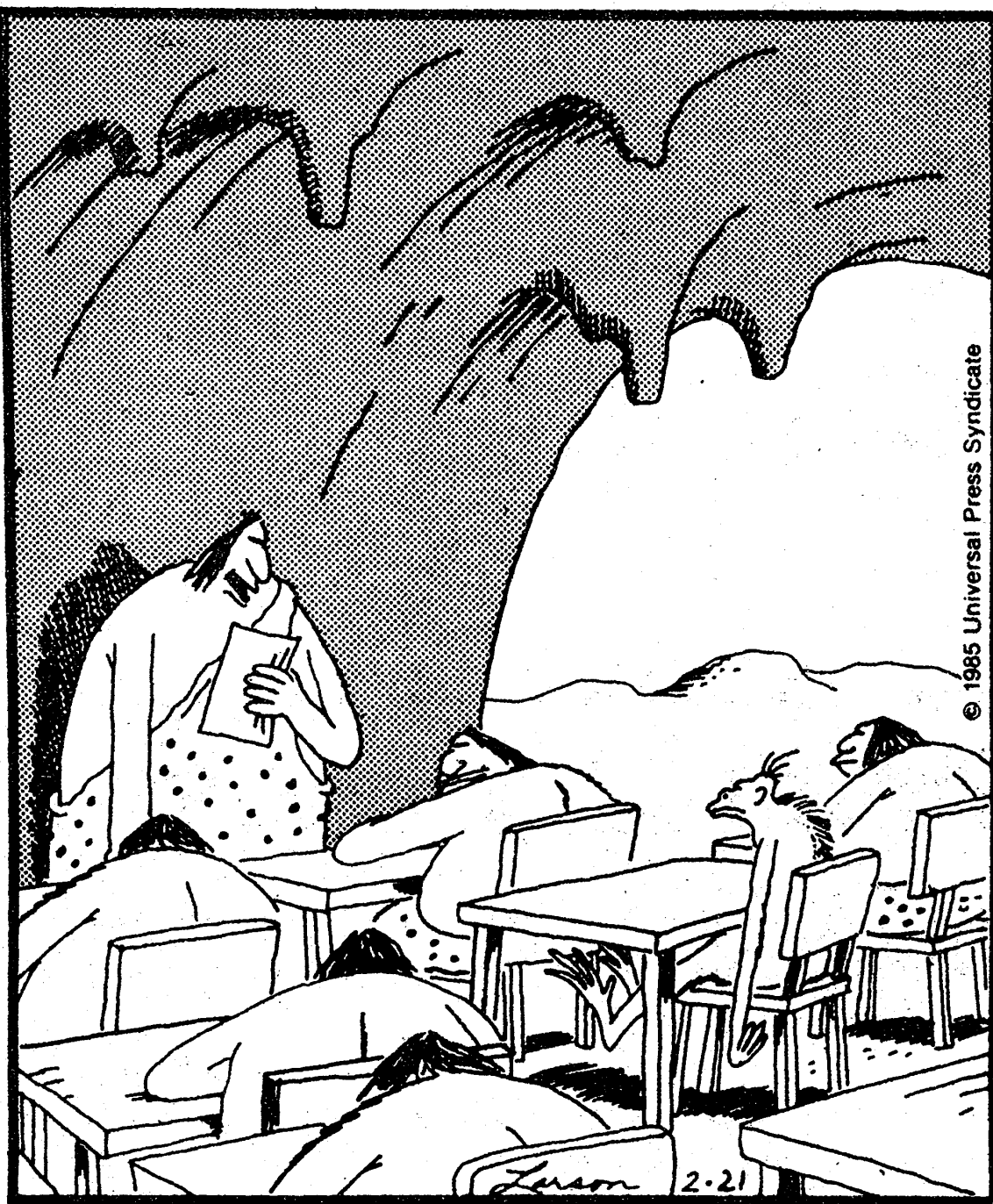
"The Far Side" is brought to you by the Dept. of Entomology and Plant Pathology

"Well, I've got your final grades ready, although I'm afraid not everyone here will be moving up."